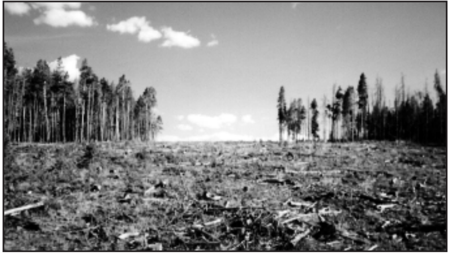
Ashley National Forest Logging Project

The timber company had just started to log in this timber sale area before the Court stopped it last year; 35 out of 2,000 acres to be exact. And it was this logging and log hauling that caused a recently discovered goshawk Nest Area to be abandoned, according to Forest Service's own biologists. Goshawk is a sensitive management indicator species for mature and old growth forests. Due to this there are many rules preventing logging that may harm goshawks. In this case the new nest area is literally inside a cutting unit for this logging project and biologists have documented the nest abandonment. The nest tree itself has been marked for cutting!